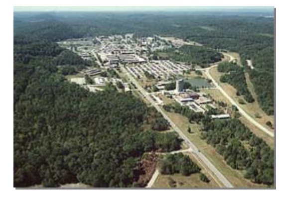
Oak Ridge National Laboratory Oak Ridge, Tennessee