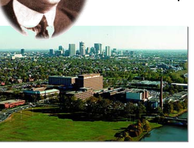
Battelle headquarters Columbus, OH