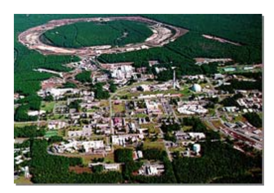
Brookhaven National Laboratory Long Island, New York