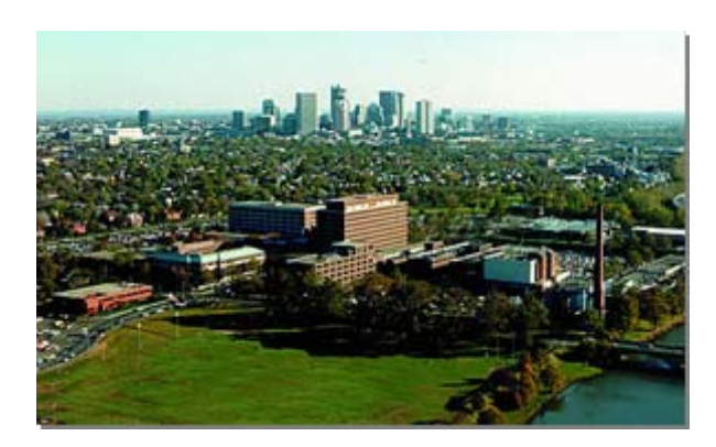
Battelle Corporate Headquarters Columbus, Ohio