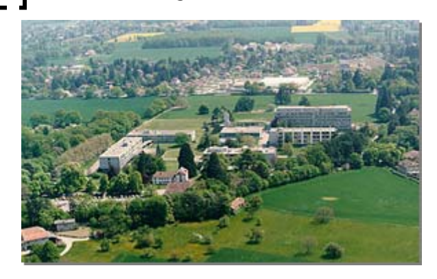
Battelle Europe Geneva, Switzerland