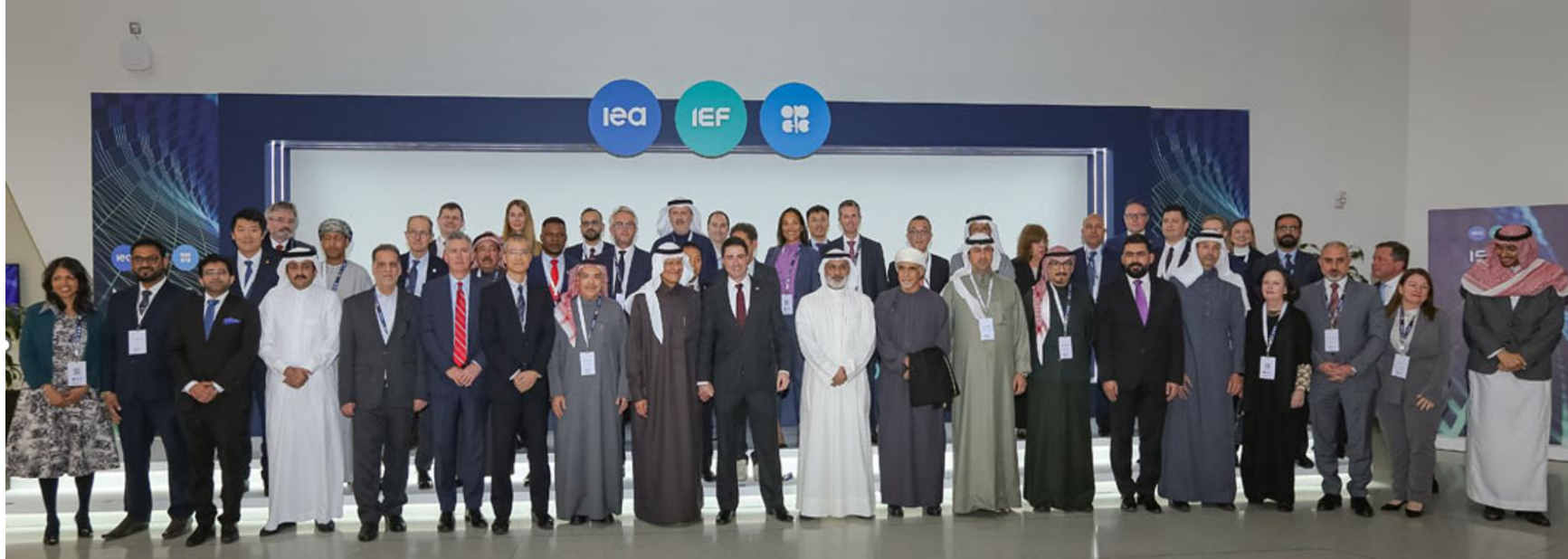
15 th IEA-IEF-OPEC Outlooks Symposium

IEA-IEF-OPEC trilateral program to reinforce energy market stability, trade and investment