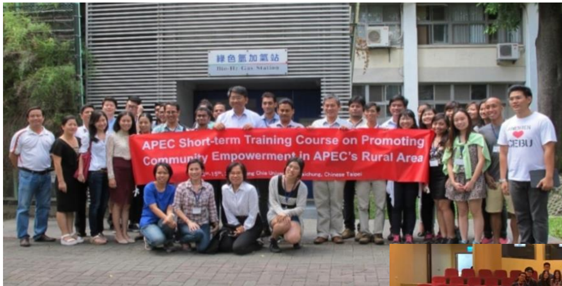
2016/7/1 -16 Promoting Community Empowerment in APEC's Rural Area