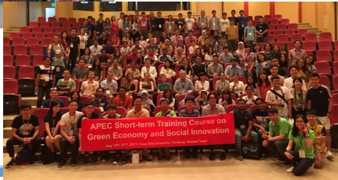
2017/8/14 -31 Green Economy and Social Innovation